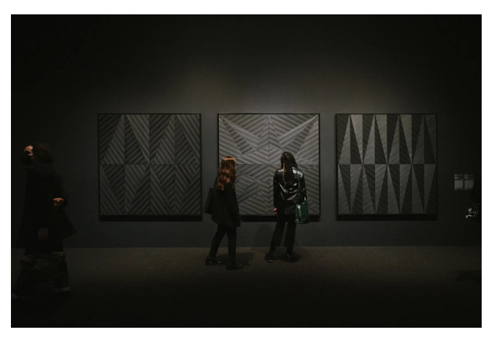
Featured in the Whitney Biennial, these pieces were painted with colliding diagonal bands in two shades of black that optically shift between lighter and darker with the viewer's movement.

Mr. Little's black paintings "take Frank Stella to a whole different level," she continued, referring to the older artist's minimalist black monochromes from the late 1950s that were seen as groundbreaking. "James is carving a little niche for himself within that very long trajectory in the history of art. It's familiar and yet it's new territory. It extends what we understand as American modernism."