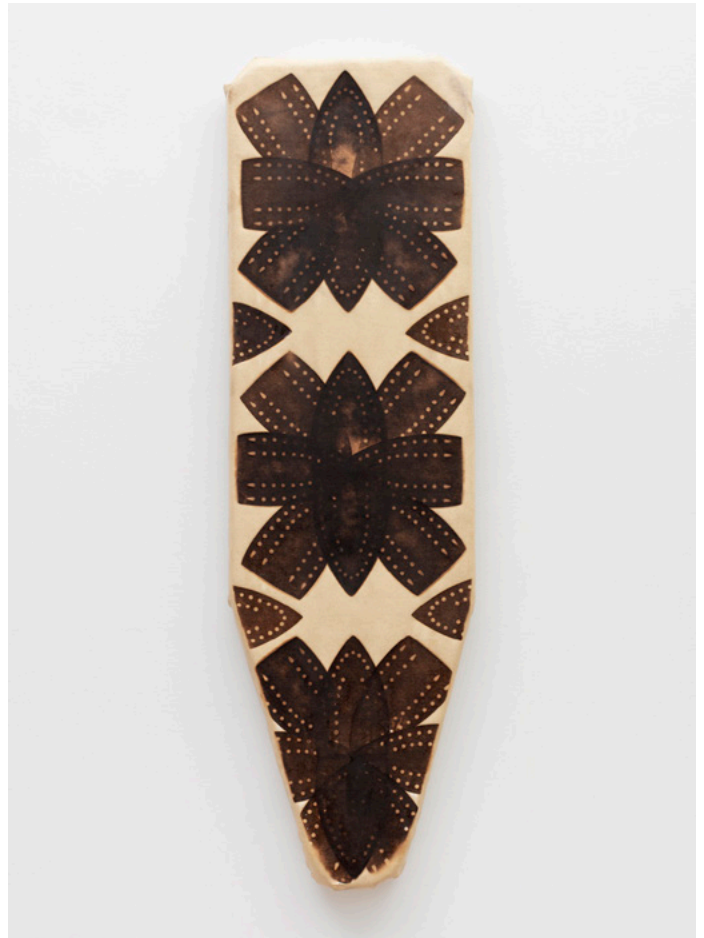
Willie Cole, Domestic Shield XV , 2020. Iron scorches on canvas with resin and wax mounted on wood, 54 x 16 x 2 1/2 in.

Bird's "Ornithology" is one of the most famous examples in jazz history of a contrafact, a technique where a musician lays a new melody down over a well-known existing chord progression. Contrafaction is about transforming something familiar to give people a chance to understand it in a new way. It's a perceptual tool, and Cole's specialty.